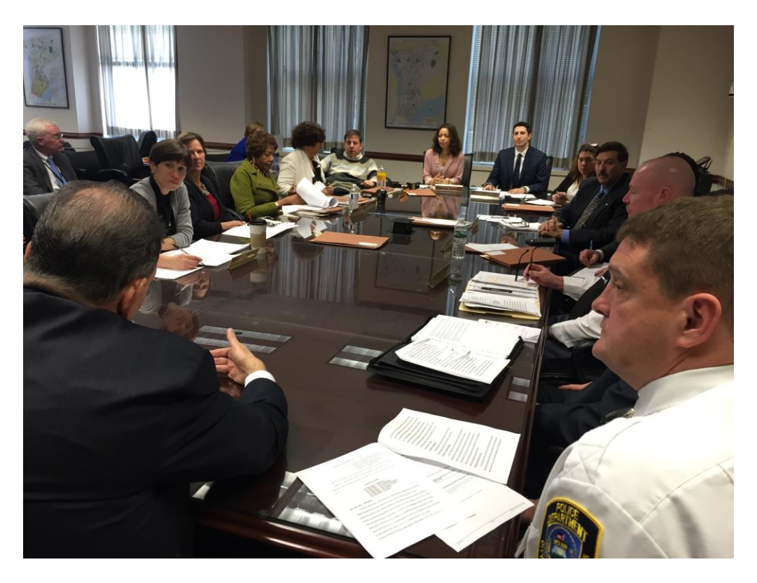
Legislators Discuss Synthetic Drug Ban with Law Enforcement and Consumer Affairs Officials on Monday at the Legislation Committee Meeting