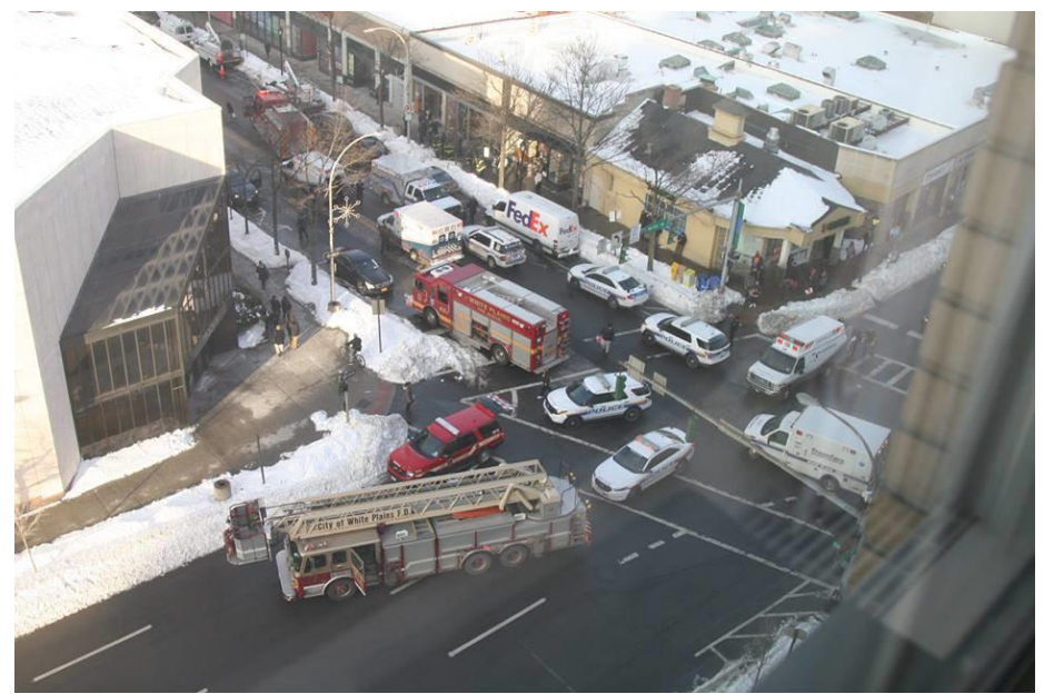
Emergency Response to Four People Sickened by Synthetic Marijuana in White Plains in January 2016